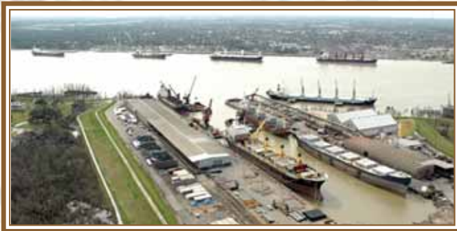
St. Bernard Port