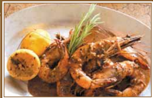
Spicy Barbecue Shrimp