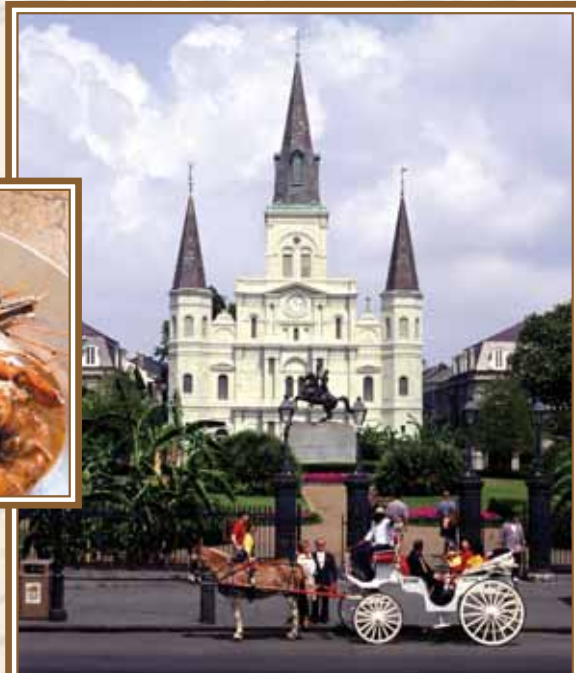
The French Quarter