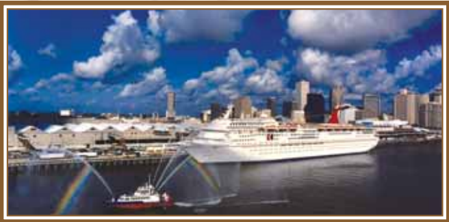
Port of New Orleans